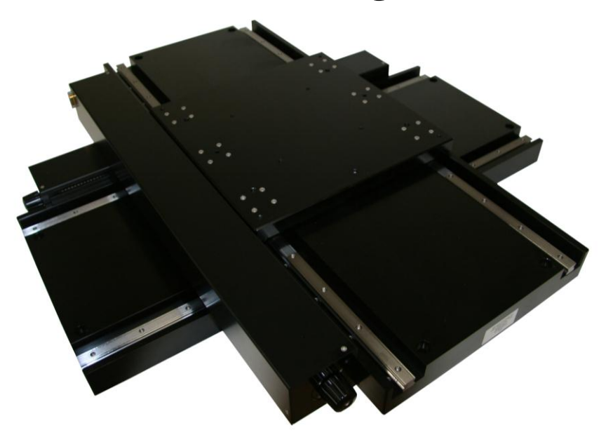
TR450 XY Stack

The TR450 body is wider than most stages in this travel length in order to minimize the cantilever and its affects when configured as an XY stage. It also provides a larger, more stable platform for sample fixturing. Vertical and horizontal straightness errors are less than \pm 5.0 \mu m over the full 450mm travel, even when measured as an XY stack. Applications include small flat panel inspection and circuit board processing.