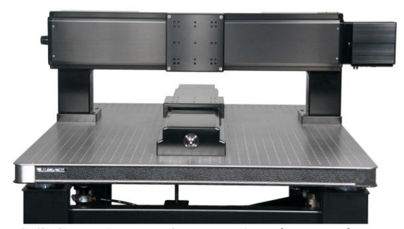
Split Gantry System using two 650mm long travel stages

guides with recirculating, caged ball bearings provide smooth, quite travel, long life and high load capacity. Because many of our stages are integrated into metrology instruments or process tools, we pay a lot of attention to the quality of all external surface finishes.